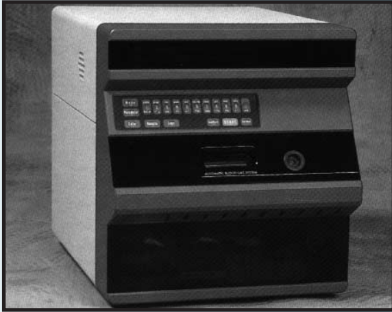
BLOOD GAS ANALYZERS